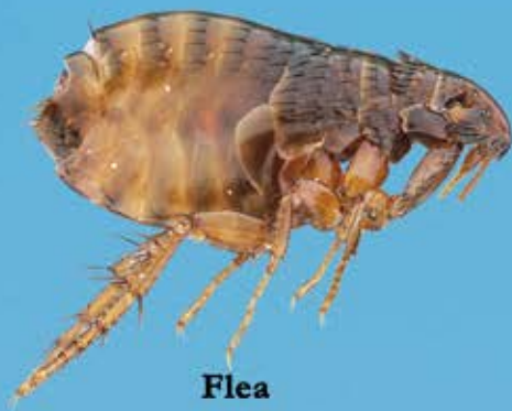
Flea (not actual size)

Bedding and Furniture - All bedding that can be washed, should be washed in detergent and hot water. Items that cannot be washed should be sprayed with an insecticide that is labeled to contain an adulticide and an insect growth regulator (IGR). There are many brands of product on the market such as, Knock Out™ , Bengal™ , and Spectricide™ . The spray must be used under and between cushions, between your mattress and box spring, remove pets from your home while spraying (or bombing), and do not return home with your pets until the treated area is dry.